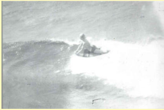
Jeff Day, Cronulla, 1960s.