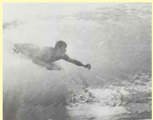
Bellybogger in action.