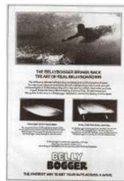
1994 Tracks ad for the bellybogger.