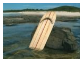
Colin Harper's bellyboard.