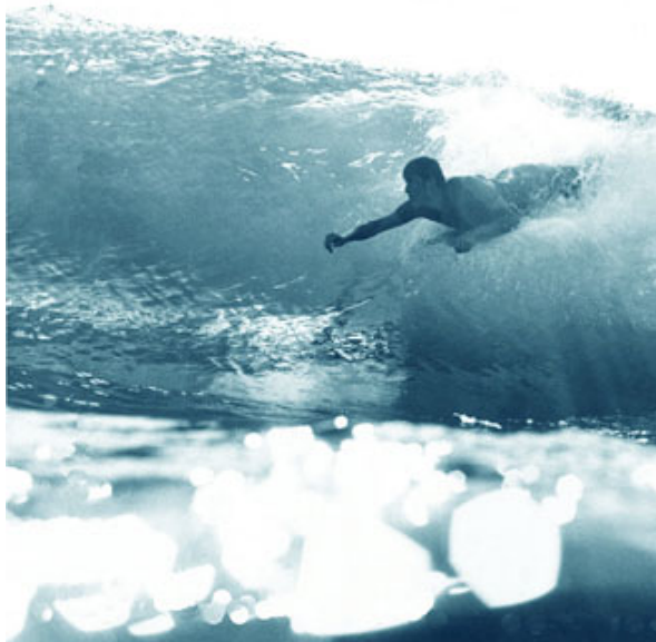
Bellybogger in action.