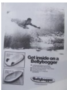
Surfing World, Vol 27(5) December 1978