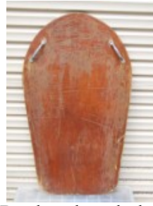
Deane Brothers board - bottom view. Deane Brothers board- deck view.