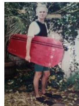
Hosking bellyboard