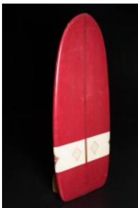
Keyo bellyboard