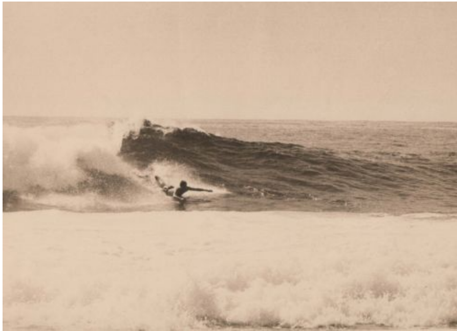
Dick Ash - down south