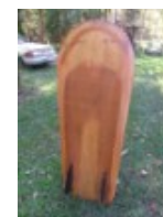
Hoskins copy.