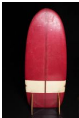
Keyo bellyboard