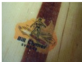
Bill Clymer logo.