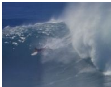
Catching an edge