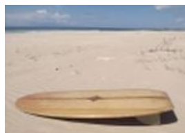
c 1963 Bennett bellyboard- 4'10" x 20 3/4