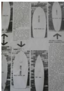
1970 Tracks ad for a Farrelly bellyrider

A later development was Midget Farrelly's "Belly Kneel-rider combination" advertised in Tracks magazine by Farrelly surfboards (Farrelly 1971a, Farrelly 1971b, Farrelly 1972a, Farrelly 1972b, Farrelly 1972c). Five foot long and twenty inches wide, the advertisement for this board refers to surfers exploring "the possibility of using a board that performs more than one function. It would seem that the ideal piece of surfing equipment could be ridden lying down, kneeling up, and possibly in the standing position". These boards were offered as either single or twin fins. Farrelly surfboards also produced "The Belly Rider" which was 48" by 19-20 inches. This board was reported to be able to "out race high speed gun boards". Features included a large single fin or twin fins, a: "slight "V" bottom and hard edges, while "The nose is sensitive being thin and scooped. A foot before the tail the deck is humped to carry the chest of the surfer". Lengths and widths could be varied and it was described as having "minimal flotation". The advertisement also stated that board had been used in Hawaiian surf up to 15 foot. These boards may well have been influenced by those of Larry Goddard whom Farrelly shared a house with in Hawaii during the winter of 1970-1971 (Goddard 2009).