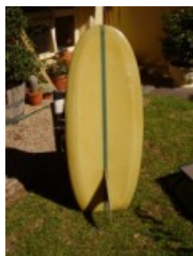
Bennett bellyboard. Bennett bellyboard.