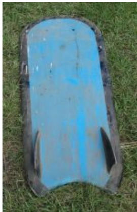
Sobels board: 48" x 20" x .5" Coachwood marine ply