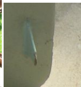
The fin is 2" x 3.5" long