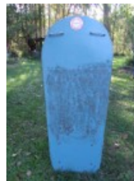
Modified copy (concave added) of a 1960s Hosking bellyboard. Gary Clist collection.