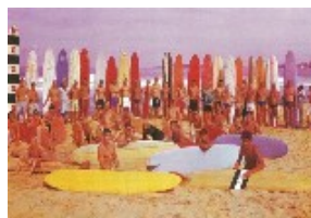
Contest, Narrabeen 1962