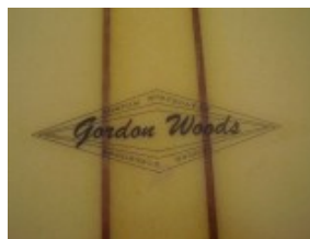
Gordon woods logo