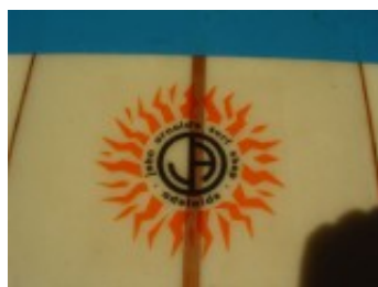
John Arnold bellyboard logo.